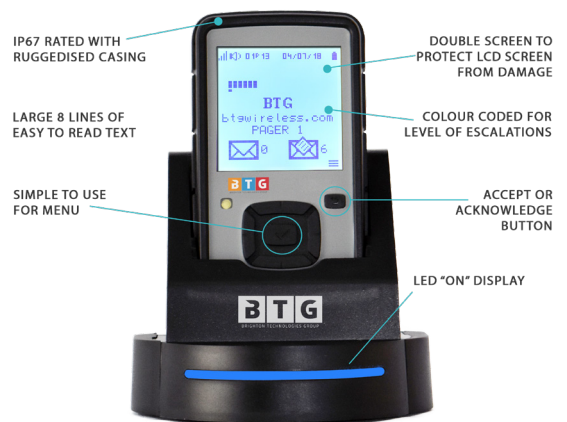
SINGLE CHARGER - CAN LINK UP TO 5 TOGETHER

The Birdy Slim IoT programming includes: 1 x Programming Cradle, 1 x USB Interface and Cable, Programming Software compatible with Windows XP, Vista, 7 and 10 and is supplied with either a UK, EU, North America or Australia Power Supply Unit.