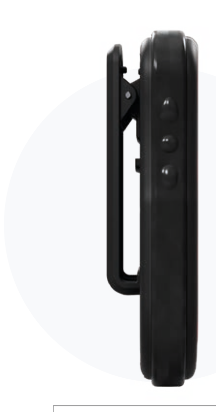
Cancel Call Buttons