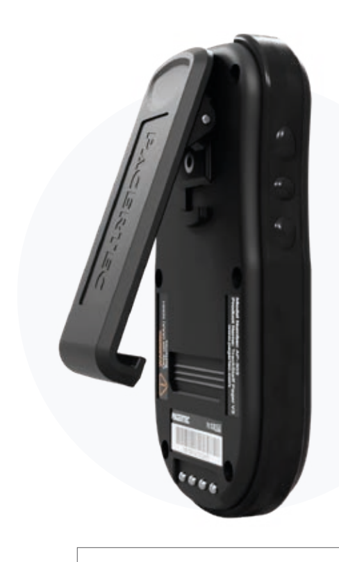
High Strength Belt Clip