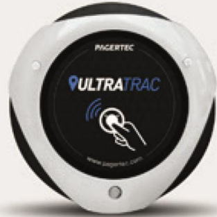
Ultra Trac Tracker