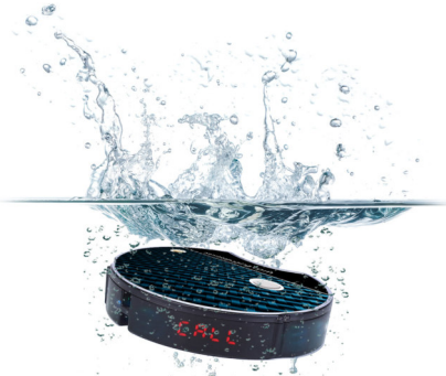
IP 67 Water Proof