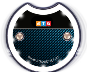
Multiple Alerts Buzz - Flash - beep