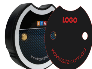
Promote Your Brand